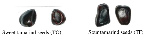
Fig. 1. The shape of tamarind seeds

Tamarind seed were supplied from local market in Thailand. Sweet tamarind seeds (TO) and Sour tamarind seeds (TF) were used in this research, as shown in Fig 1. Woven cotton fabric with the weight of 114 g/m 2 which was already scoured and bleached was used. Bombyx Mori (83 g/m 2 ) and Eri (253 g/m 2 ) silk woven fabrics were degummed and bleached before use. Sodium sulfate (Na 2 SO 4 ), zinc sulphate (ZnSO 4 .7H 2 O), potassium dichromate (K 2 Cr 2 O 7 ) and ferrous sulphate (FeSO 4 .7H 2 O) used were laboratory grade reagents.